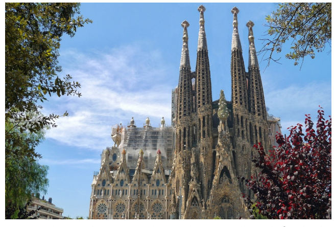
Sagrada Familia in Barcelona—be nice when it's finished.

blow our own trumpet a bit here as everyone received their refunds within two weeks of cancellation as required by law. You may have noticed articles in the press where some companies are refusing to pay refunds or holding the money back for several months.